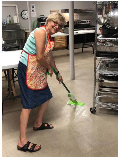
She also “likes to clean!”